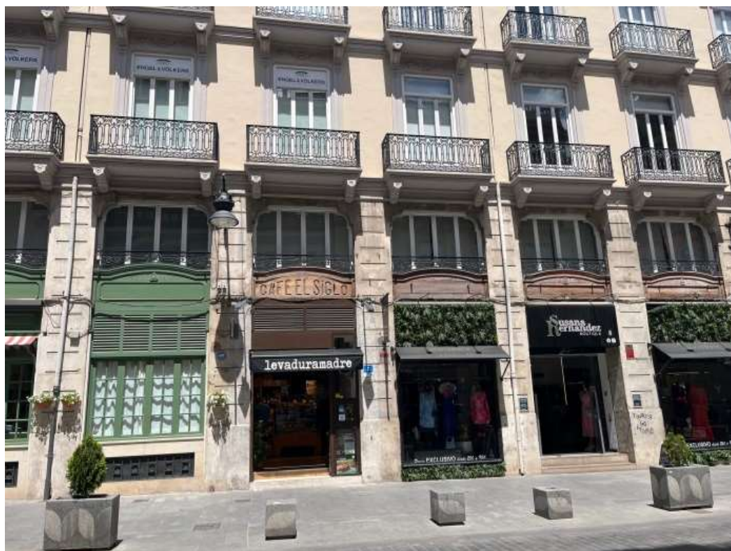
Café El Siglo façade in 2025.