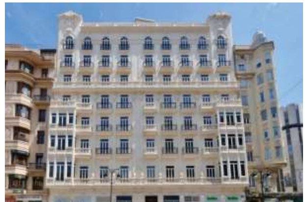
Hotel Metropol façade in 2025