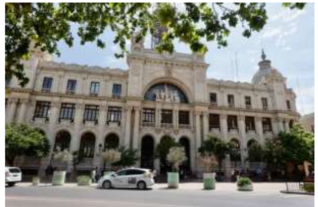
Detail of the façade of Edificio de Correos or Palacio de las Comunicaciones