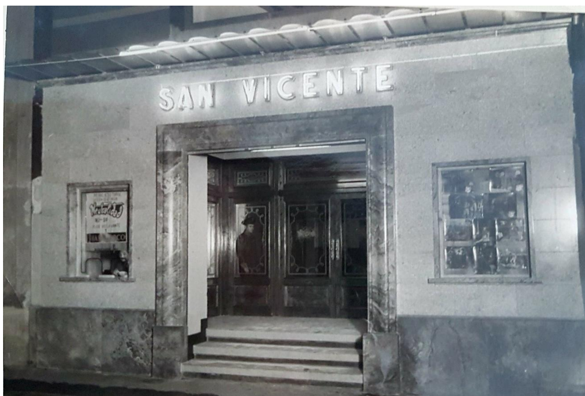
Façade of San Vicente cinema