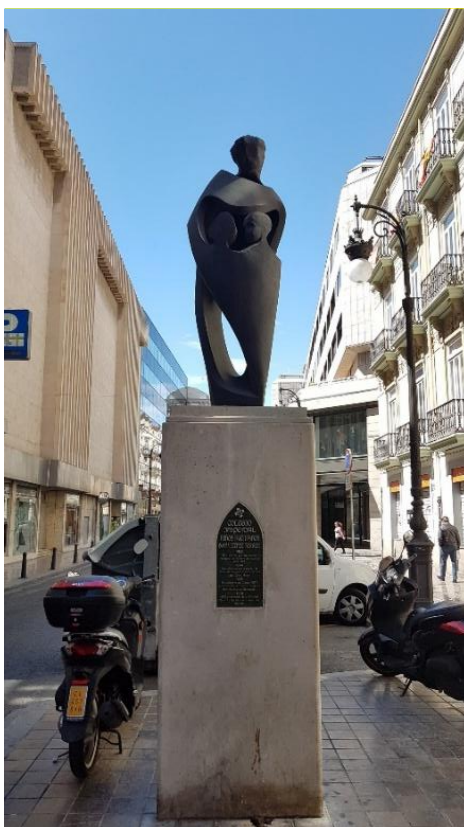
Photo of the statue of Saint Vincent Ferrer on Pérez Baier Street